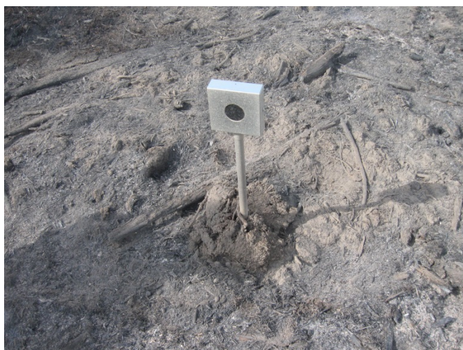
Figure 3. The new heat flux sensor positioned 1 m above the ground on a stainless steel pole.

A simple user guide will also be developed to assist users in using the sensors. A short instruction manual on downloading the data and then converting it to heat flux should make it easy for anyone to use these sensors.