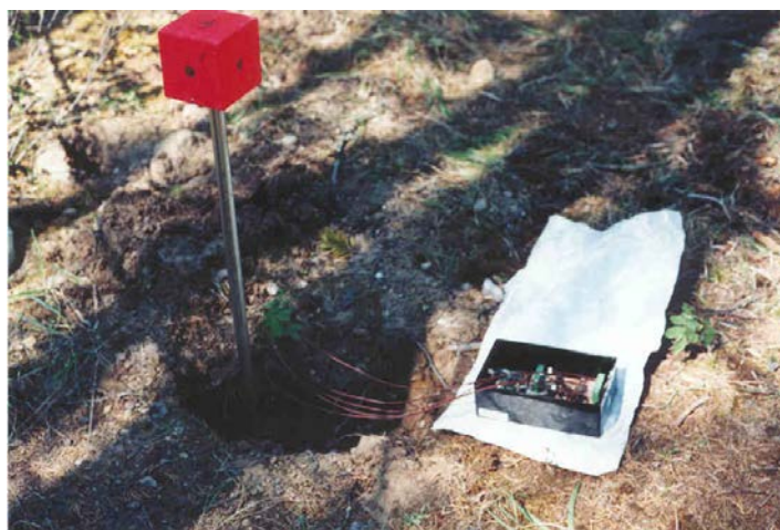
Figure 2. The old style of heat flux sensor.