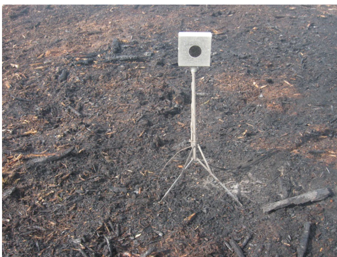
Figure 4. The new heat flux sensor positioned 1 m above the ground on a basic metal sheet-music tripod.