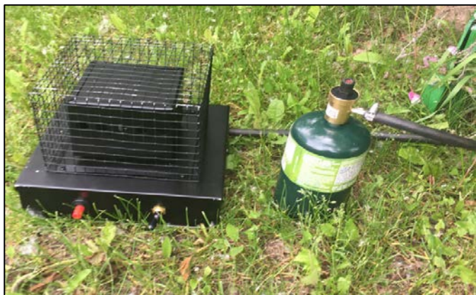
Figure 3. Prototype Hotspot Target

Initial bench testing was completed by Myac Consulting Inc. during prototype assembly and a demonstration was provided to AFF staff in the spring of 2017. The AAF Geomatics Section provided further field testing throughout the summer of 2017 and approved both its design and functionality.